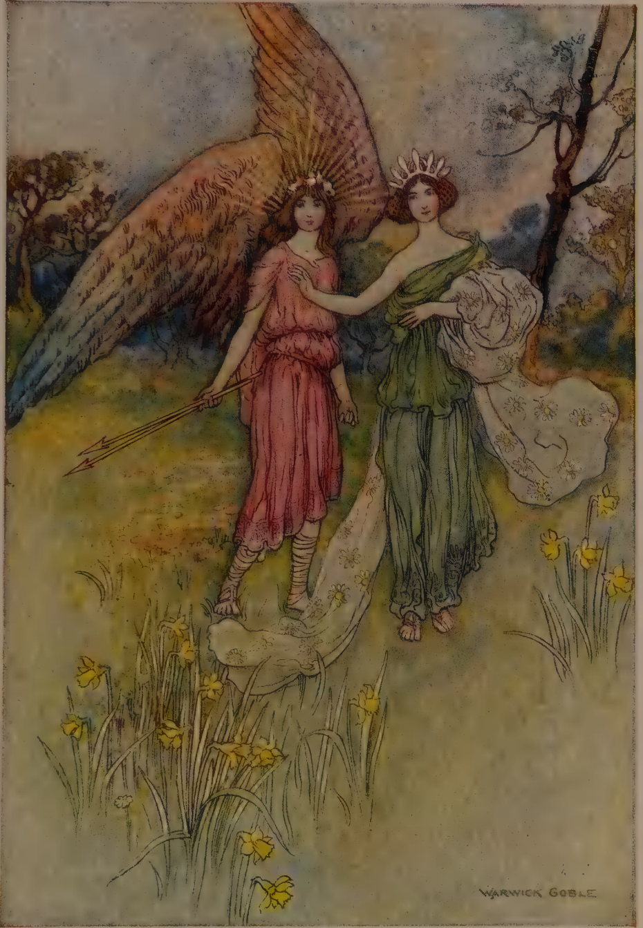
ALCESTE AND THE GOD OF LOVE